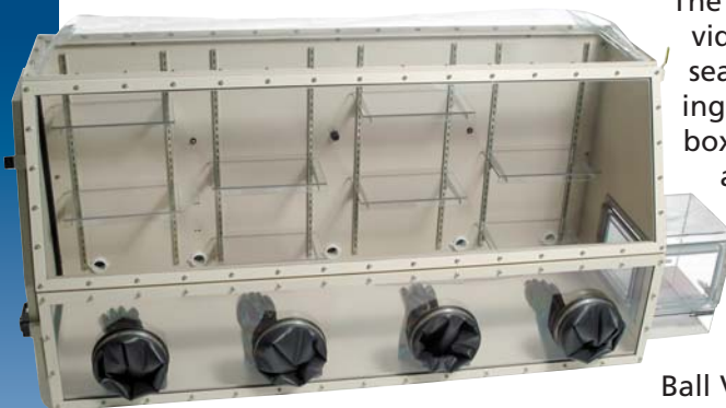
ALUMINUM GLOVE BOX

The door gaskets provide a safe positive seal without interfering with full access to the glove box interior. The viewing slope allows the user an uninterrupted view of the work in progress. Gloves are easily exchanged/ replaced in a matter of minutes. Pressure Relief Valves and Manual Inlet Ball Valves make it easy to purge in a desired gas mix for oxygen or moisture control.