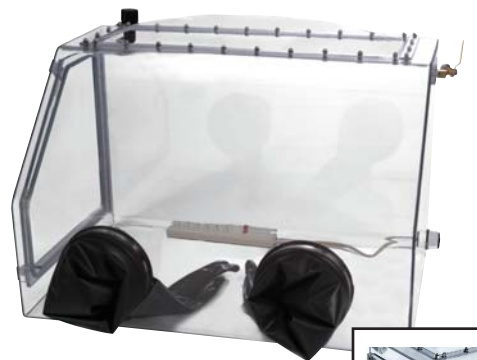
POLYMER GLOVE BOX

All Basic COY Glove Boxes are fabricated to meet rigorous standards for cleanliness and durability. Solvent welding ensures an air-tight structure that won't leak.